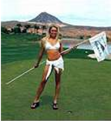
Natalie Gulbis puts her best assets forward her pinup calendar.